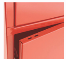
Guardian PLUS (Top and Bottom Doors)