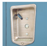
Defiant II Single Point Latch