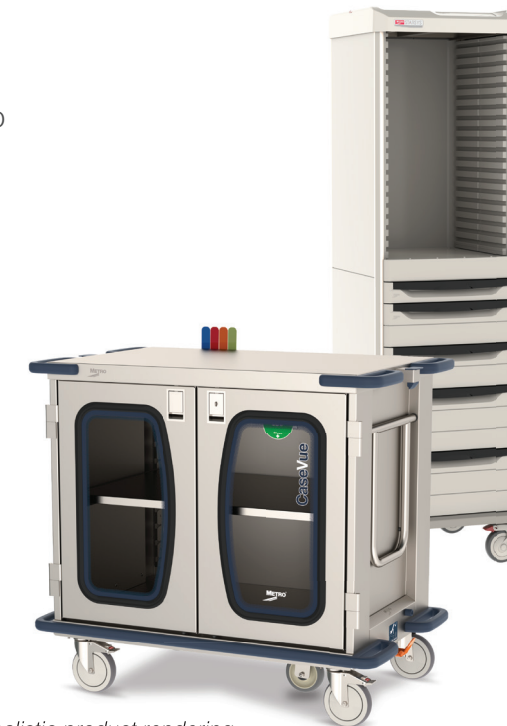
Photo realistic product rendering. Wow...looks real to us too.