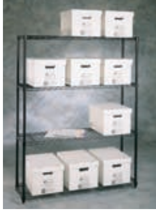
Office Storage Consists of: 14"Dx48"Wx63"H Qty. Cat. No. 4 L1448B shelves 4 L63PB posts