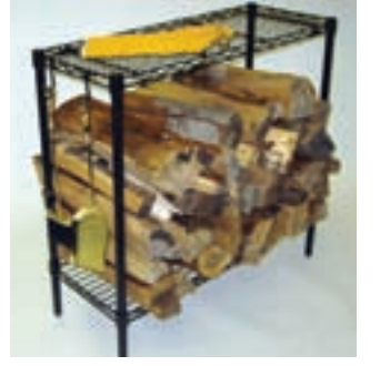
Fire Wood Organizer 14"Dx36"Wx33"H Consists of: Qtv. Cat. No.