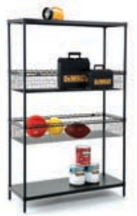
Bulk Storage 18"Dx48"Wx74"H Consists of: Qty. Cat. No. 2 L1848FB solid shelves BSK1848B basket shelves 1 74PP parts 4 L74PB posts