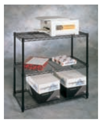
Copy Center Consists of: 18"Dx36"Wx45"H Qty. Cat. No. 3 L1836B shelves 4 L45PB posts