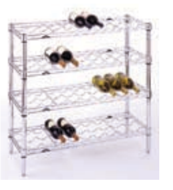
Wine Storage Consists of: 14"Dx36"Wx33"H Qty. Cat. No. 4 L1436C shelves 4 L33PC posts