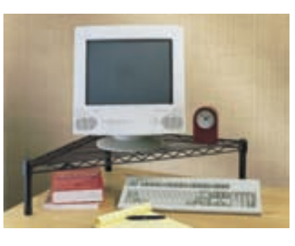
Monitor Stand 18"Dx25"Wx7"H Consists of: Qty. Cat. No. 1 L18TRB shelf 4 L4PK7B posts

Office Organizer 14"Dx36"Wx54"H Consists of: Qty. Cat. No. 4 L1436C shelves 4 L54PC posts