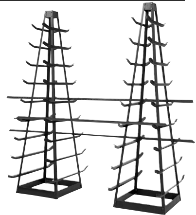
Two 235-SRH1 shown

This unit is 84" high x 22" square at bottom and is tapered to 4 1/2" square at the top. Angled steel arms are spaced every 8 1/2" and extend 8" from uprights. Capacity per pair of arms is 100 lbs. Unit weight is 60 lbs. Finish: Powder Coated Gray