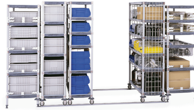
For wet or corrosive environments with a lifetime warranty against rust and corrosion.