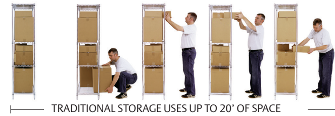
TRADITIONAL STORAGE USES UP TO 20' OF SPACE