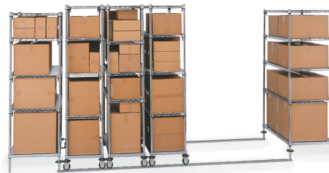
Available in chrome finish for dry storage, Metroseal 3™ epoxy for damp environments, or Type 304 stainless for corrosive environments.