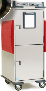
T-Series Transport Armour®