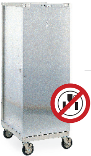
CD Series Non-insulated