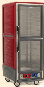
3 Series Insulation Armour®