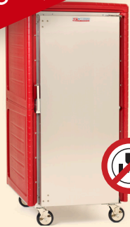
4 Series Insulation Armour® Plus