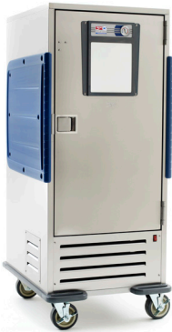
R-Series Transport Armour®