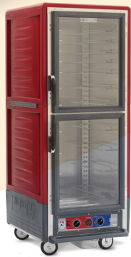
3 Series Insulation Armour®