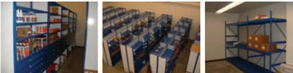
Mike W., parts manager

"Equipto V-Grip™ shelving is a great product. We especially like the modular drawers in the shelving that we use for storage of small parts. Everything went smooth with the installation and we are very happy with the end result"