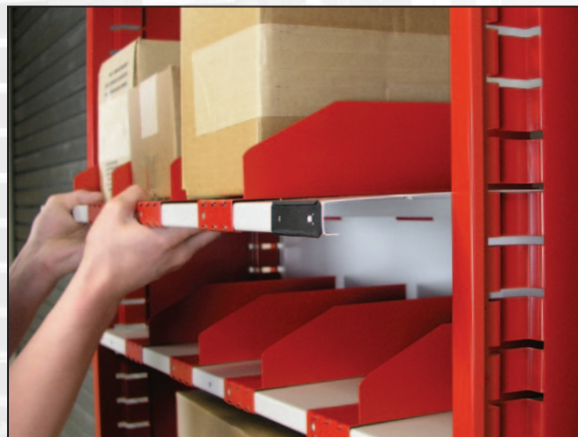
Add or remove slide-in shelves. Shelves adjust on 1-1/2" increments and lock in place automatically.