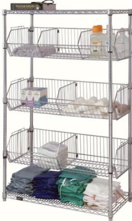
Wire Baskets for Dispensing