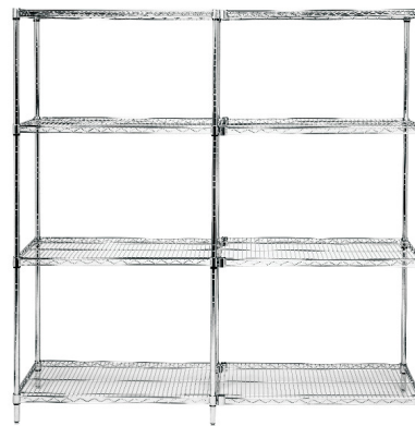
Starter & Add-On Unit