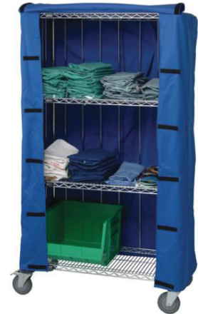
Enclosed-side Carts with Velcro Covers