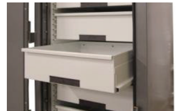
Smooth Glide Track Drawers