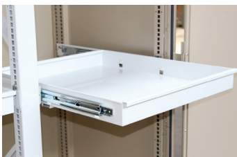
Drawers with Full Extension Slides

*Slides available for 180, 200, and 300 lb capacities Pull Out Work Shelf Available on Entomology & Herbarium Cabinets.