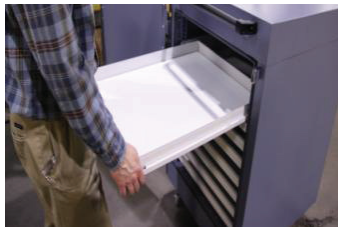
Smooth Glide Track Drawers with Security Stops