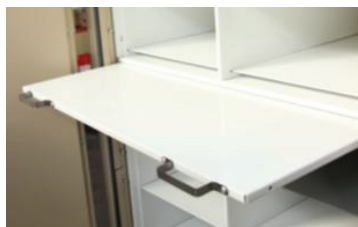
Pull Out Work Shelf