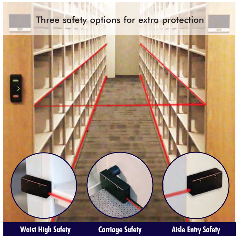
Three safety options for extra protection