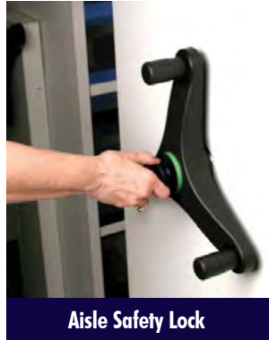
Aisle Safety Lock