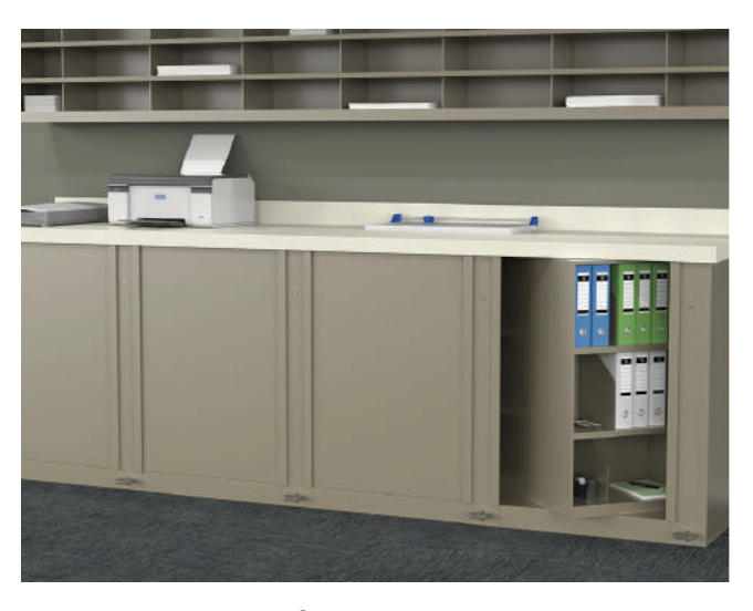
Eco-fri ndly Finishes