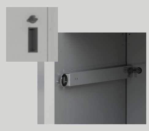
Knob Lock w/ Ergonomic Back Release Lever