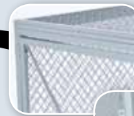
WIRE MESH CEILING