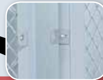
ADJUSTABLE PADLOCK HASP