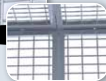
WELDED WIRE MESH