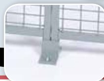
BASE SHOE FLOOR CONNECTION