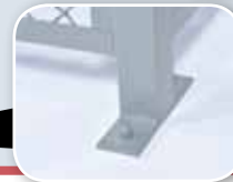
BASE PLATE FLOOR CONNECTION