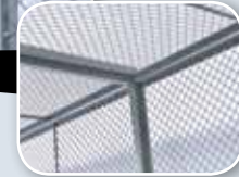
WOVEN, WELDED WIRE OR EXPANDED METAL