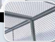
WOVEN WIRE MESH