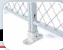
BASE SHOE FLOOR CONNECTION