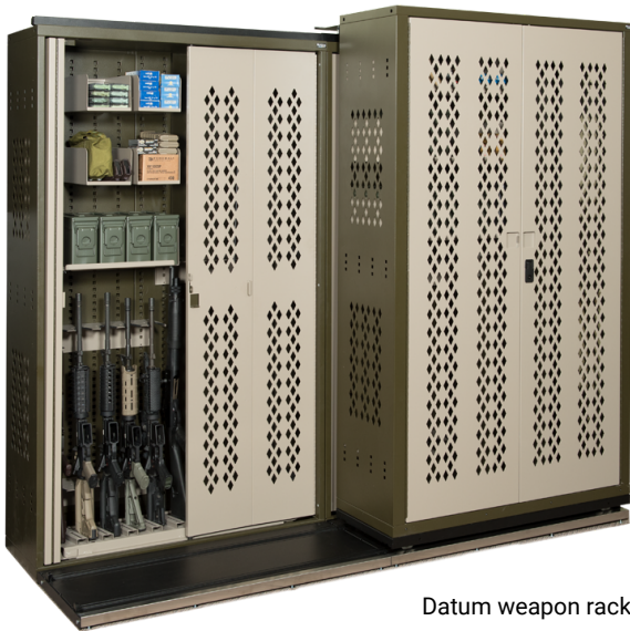
Datum weapon racks sold separately.